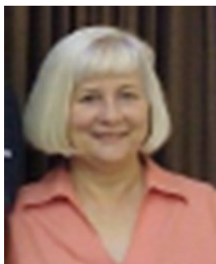
South Bend Club